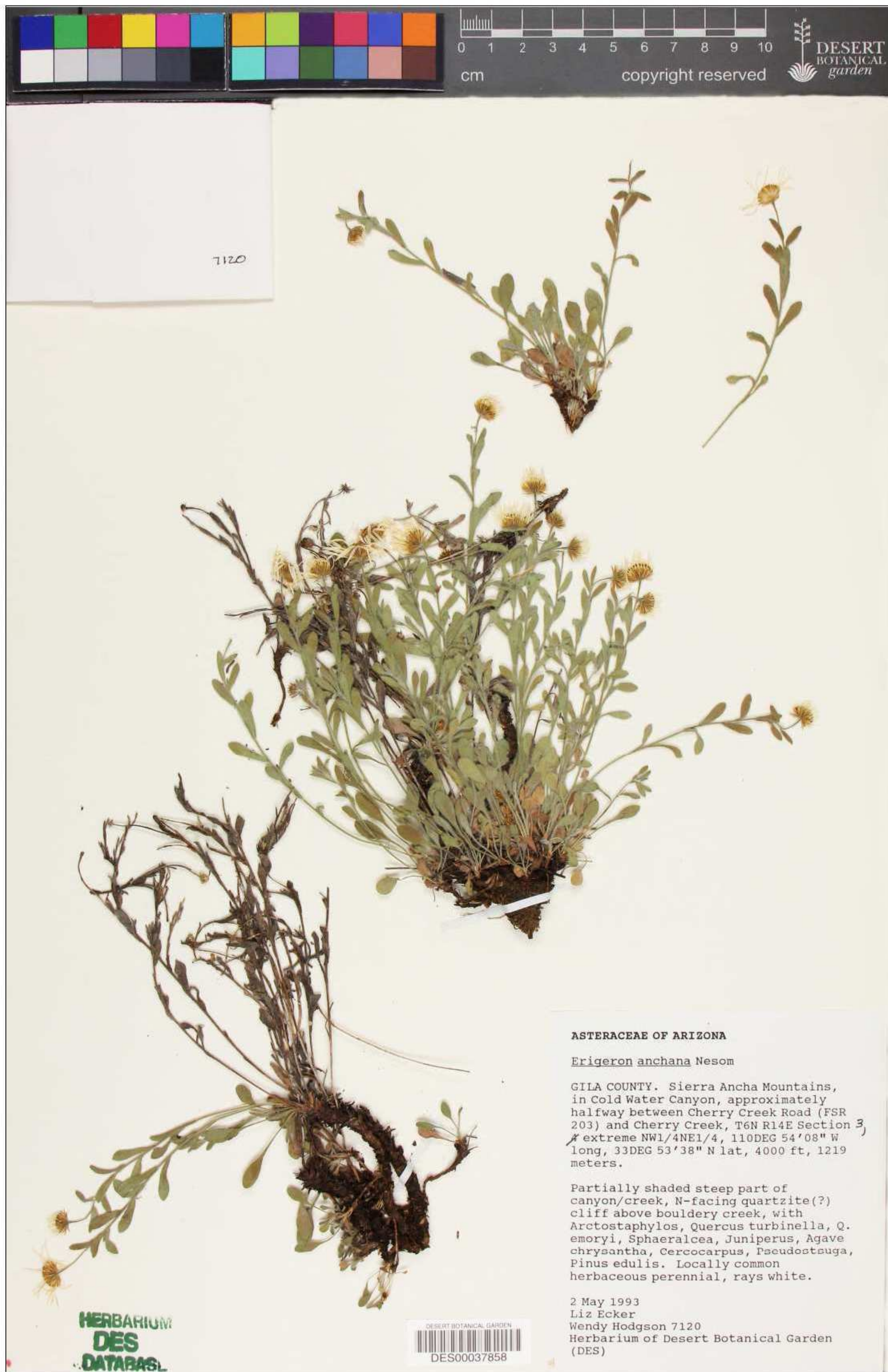
Figure 4. Erigeron hodgsoniae , Hodgson 7120, DES.